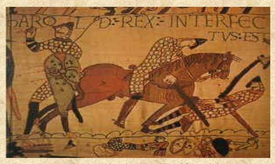
Bayeux Tapestry showing King Harold struck by the arrow

THE DISCOVERY OF STONE ARROWHEADS IN AFRICA TEND TO INDICATE THAT THE BOW AND ARROW WERE INVENTED THERE, MAYBE AS EARLY AS 50,000 BC. BETWEEN 25,000 AND 18,000 BC FLINT ARROWHEADS WERE SHAPED AND ATTACHED VIA A SLOT AND TIED WITH SINEW. FEATHERS WERE ATTACHED TO THE ARROW. A WEAPON WAS DEVELOPED NOT ONLY FOR HUNTING BUT FOR WARFARE.